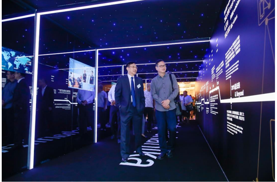
In 2004, Automechanika Shanghai found itself situated in one of the most promising and fastest-growing markets worldwide. It hosted 235 exhibitors and 9,138 visitors. 2006 experienced even more traction. In this light, organisers turned the show into an annual event. Since 2015, it relocated to the National Exhibition and Convention Center (Shanghai) to accommodate the influx of participants.

The history and people behind Automechanika Shanghai's endurance in the market